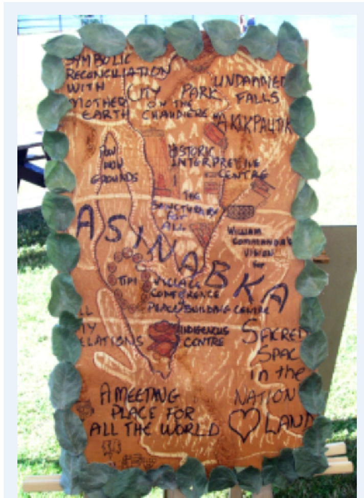
The Vision for Asinabka / Victoria Island